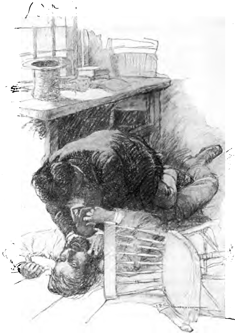
His fingers twined about the purplish throat.— Page 211